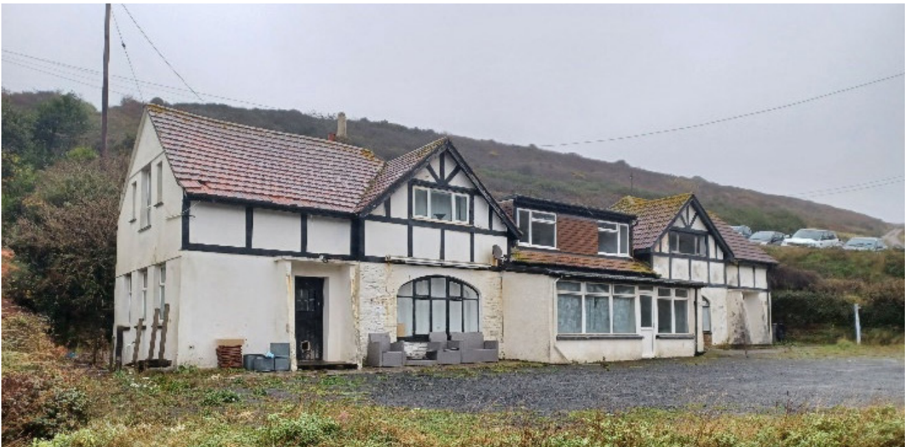
Terrace of three cottages